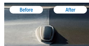
Unpainted resin parts